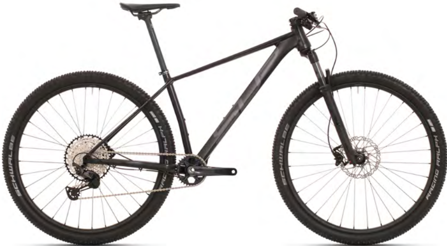
MATTE BLACK/DARK SILVER