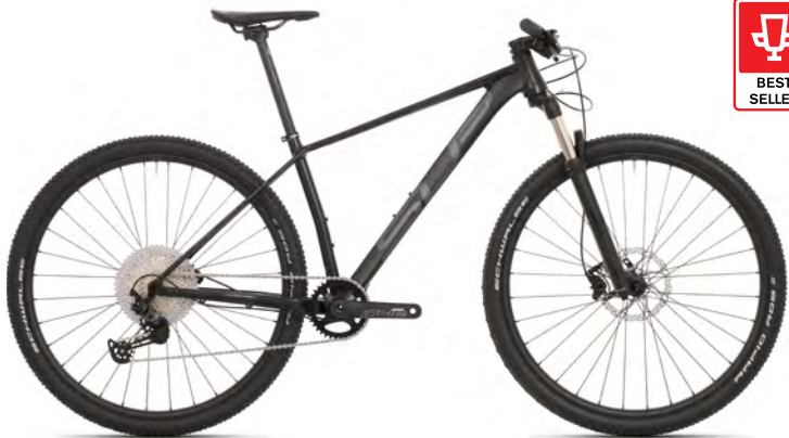
MATTE BLACK/DARK SILVER