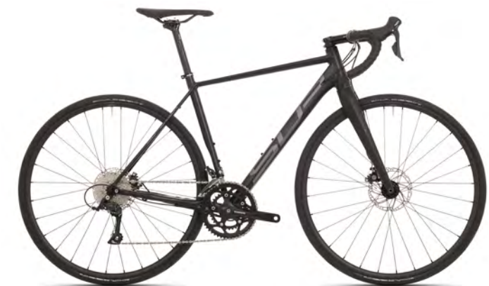
MATTE BLACK/DARK SILVER