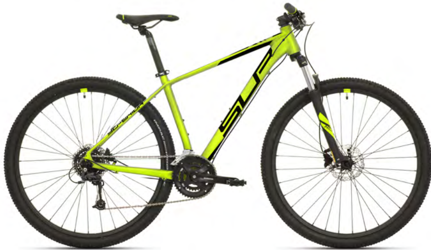
MATTE RADIOACTIVE YELLOW/BLACK