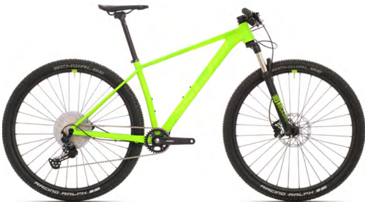
MATTE LIME GREEN/NEON YELLOW