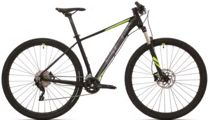
MATTE BLACK/DARK SILVER/NEON YELLOW