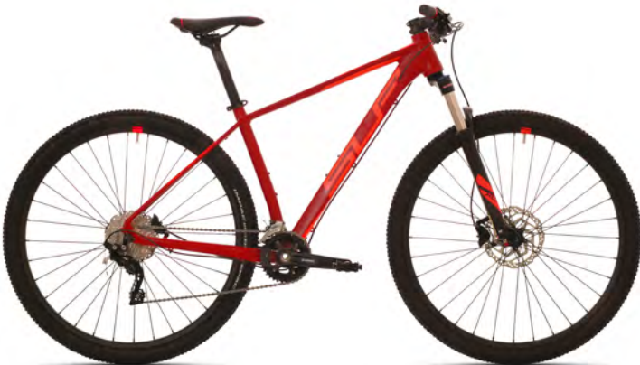
MATTE BRICK RED/NEON RED