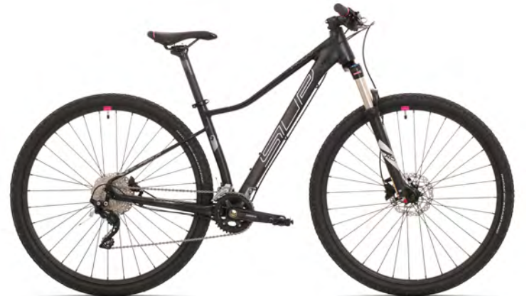
MATTE BLACK/CHROME SILVER