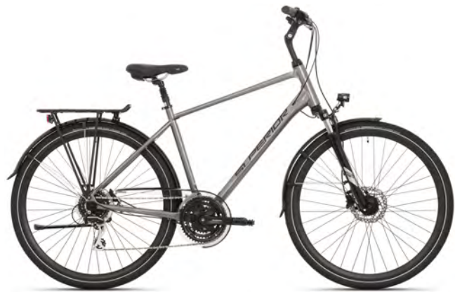
GLOSS TITANIUM, MATTE COFFEE BLACK