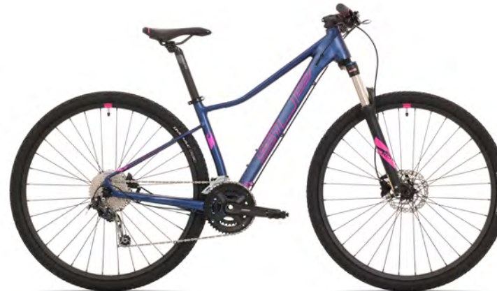
MATTE NIGHT BLUE/PINK