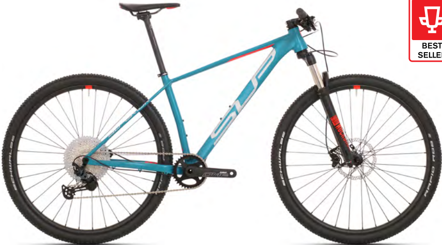
MATTE PETROL BLUE/SILVER/RED