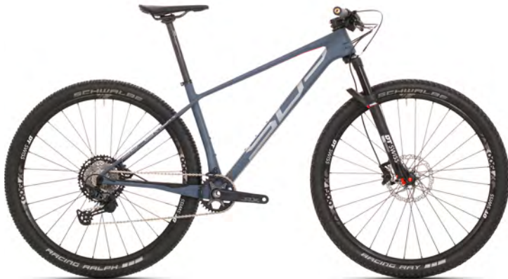
MATTE SLATE GREY/SILVER/RED