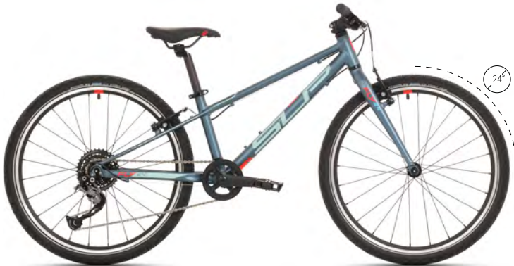
MATTE DARK GREY/GREY/NEON RED