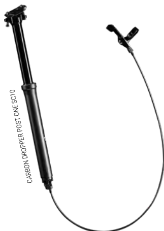
CARBON DROPPER POST ONE-SC10