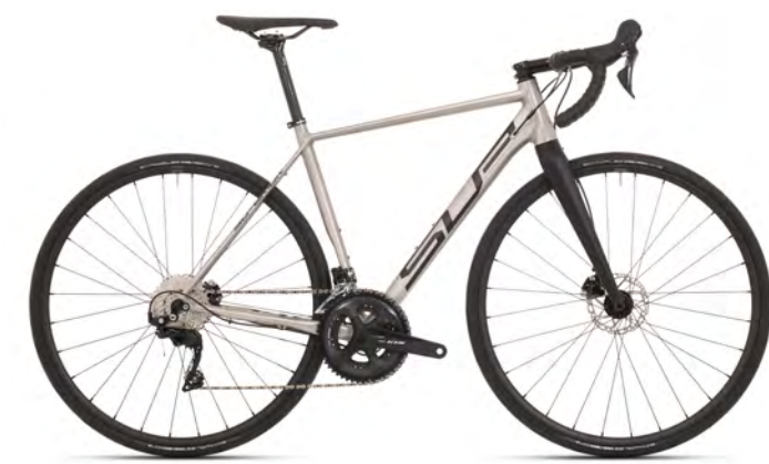
MATTE SMOKY ALU/BLACK