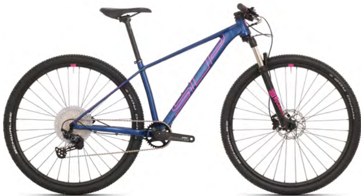
MATTE NIGHT BLUE/PINK