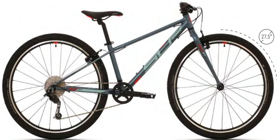
MATTE DARK GREY/GREY/NEON RED