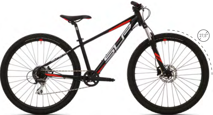
MATTE BLACK/WHITE/TEAM RED