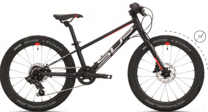
MATTE BLACK/WHITE/TEAM RED