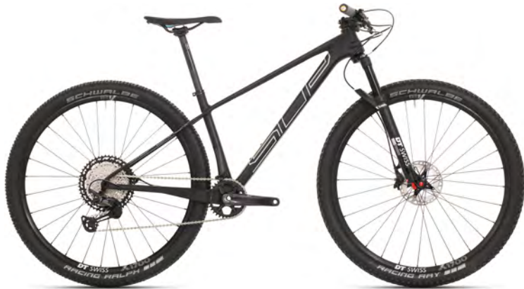
MATTE CARBON/HOLOGRAM CHROME