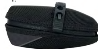
S.BAG 30 L