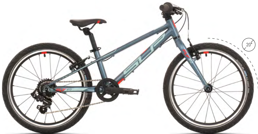
MATTE DARK GREY/GREY/NEON RED