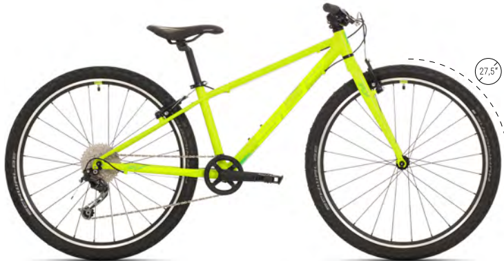
MATTE LIME GREEN/NEON YELLOW