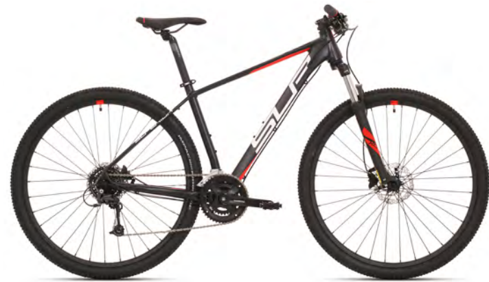
MATTE BLACK/WHITE/TEAM RED