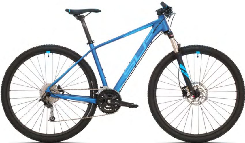
MATTE DARK BLUE/NEON BLUE