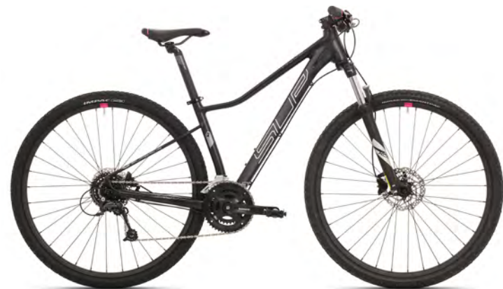
MATTE BLACK/CHROME SILVER