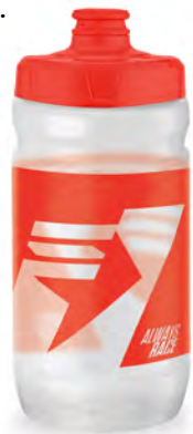
FL.Y. BOTTLE 400