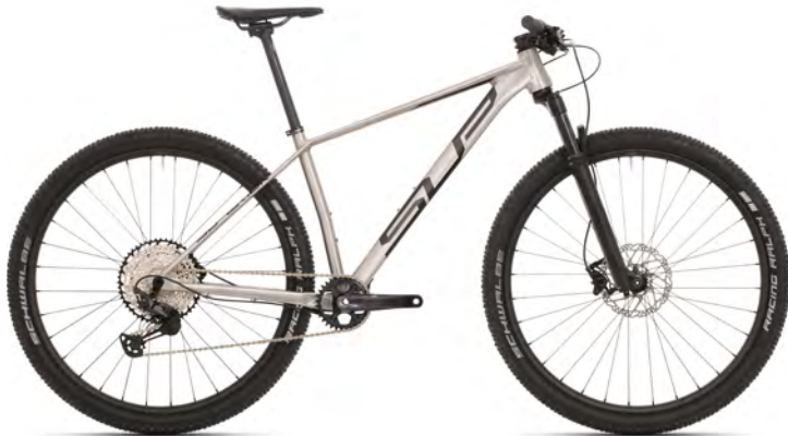
MATTE SMOKY ALU/BLACK