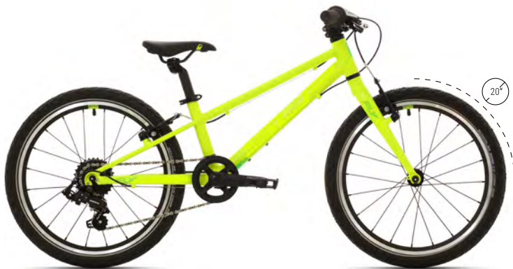
MATTE LIME GREEN/NEON YELLOW