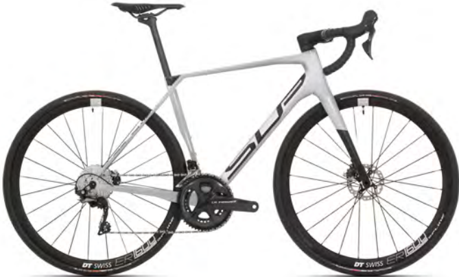
MATTE SILVER/DARK CHROME