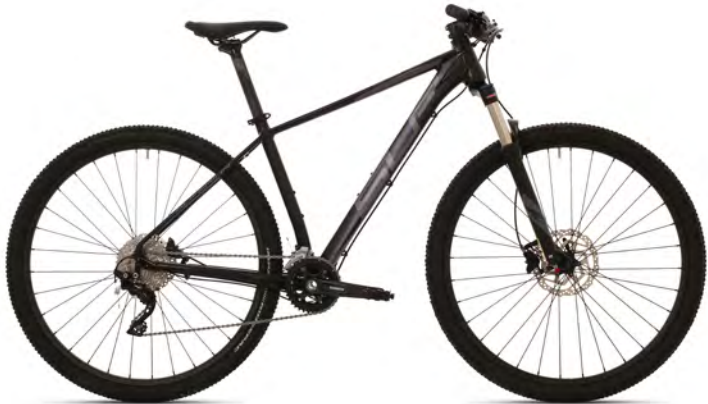
MATTE BLACK/DARK SILVER