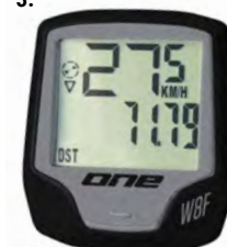
C.COMP 8 WIRELESS